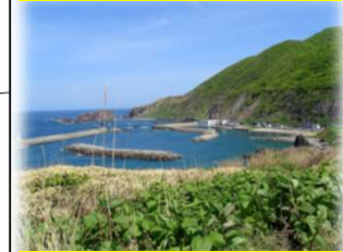
Kamuiwaki fishing port