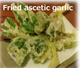
Fried ascetic garlic