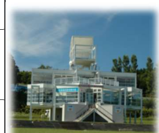
Yoshinori Sato Baseball Museum