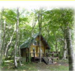
Beech tree forests