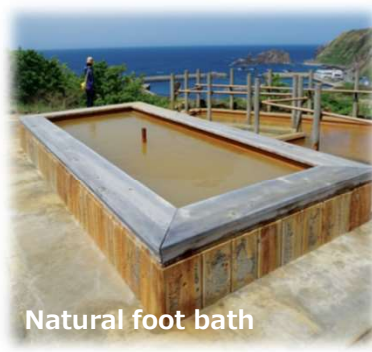
Natural foot bath