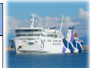
M/V Calanthe Okushiri