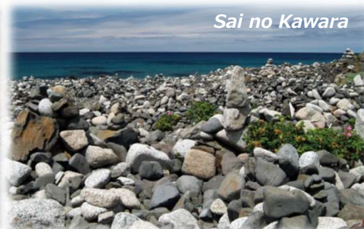
Sai no Kawara