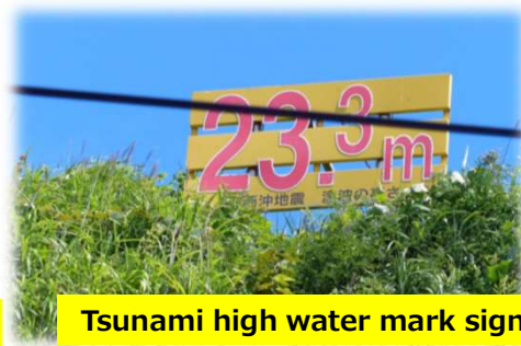
Tsunami high water mark sign