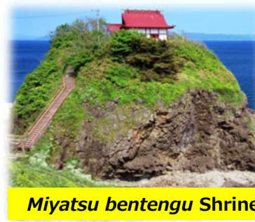
Miyatsu bentengu Shrine