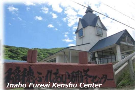
Inaho Fureai Kenshu Center