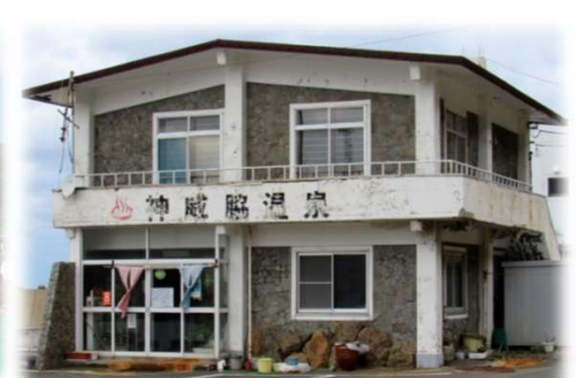
Kamuiwaki hot spring