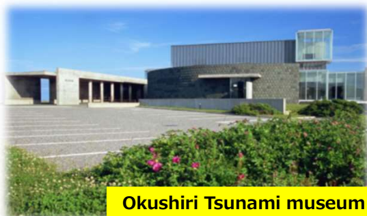
Okushiri Tsunami museum