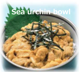
Sea urchin bowl