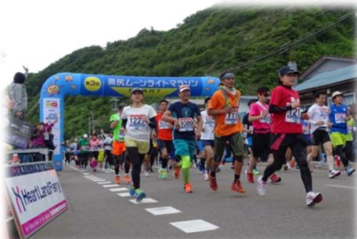
Okushiri moonlight marathon