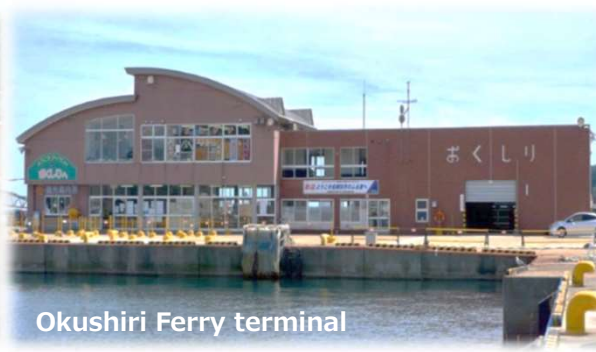
Okushiri Ferry terminal