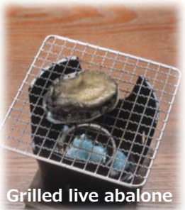
Grilled live abalone